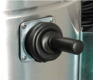
Side Mounted Manual Filter Shaker