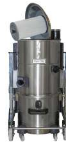
HEPA Filter - Included