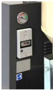
Filter Blockage Indicator Gage. Manual Starter with Overload Protection