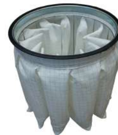
Conductive Star Shaped Filter with Cage for ORDLOC 652 - Included