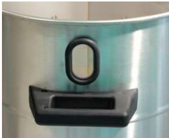
Sight Glass on Recovery Tank