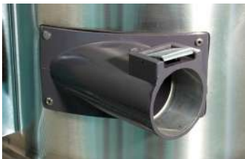
Tangential Suction Inlet, 70mm, Aluminum