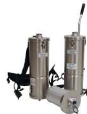
MV-1CR (CV) BP (Backpack) & GC (Golf Cart) models shown with Containment HEPA Filter - Included