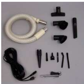
MV-1CR (CV) Tools and Accesories - Included