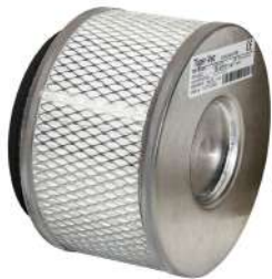
ULPA Filter - Included