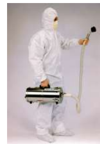
MV-1CR (CV) HH (Hand Held)