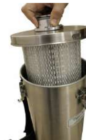
MV-1 CR (CV) Containment HEPA Filter - Included