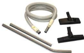
MV-1CR Tools and Accessories - Optional