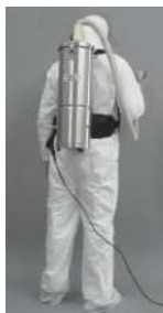
MV-1CR (CV) BP (Backpack)