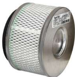
HEPA Filter - Included