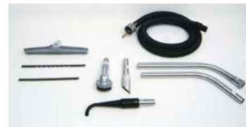
Ø1.5 (Ø38mm) Static Dissipative Tools and Accessories - Included