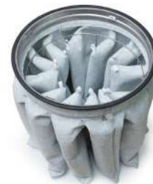
Conductive Star Shaped Filter with Cage - Included