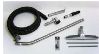
Ø2" (Ø50mm) Static Dissipative Tools and Accessories - Included