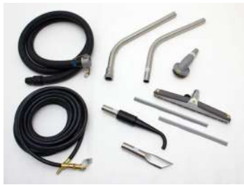
Ø1.5" (Ø38mm) Static Dissipative Tools and Accessories (Pneumatic) - Included