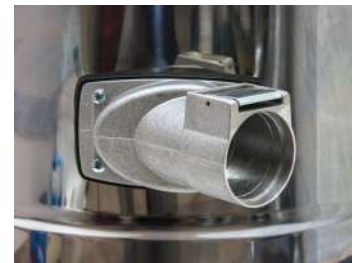
Suction Inlet, 60mm, Aluminum (GL Series)