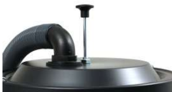
Top Mounted Filter Shaker (GL Series)