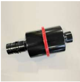
Detachable Exhaust Silencer (GL Series)