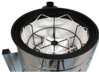
Polyester Main Filter (GL Series)