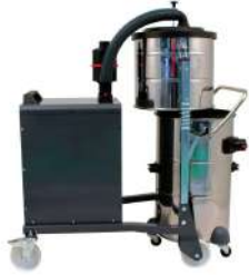
Side view of Detachable Tank (GL Series)