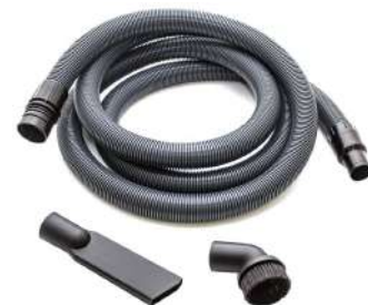
Basic Tool Kit (GL Series) - Included