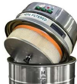
HEPA Filter Cartridge - Optional