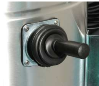
Side Mounted Manual Filter Shaker