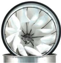
Star Shaped Polyester Main Filter