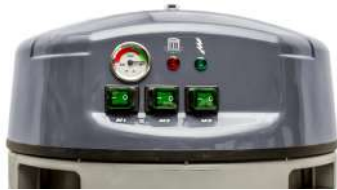
Independent Control for each motor. Pressure Gage and Filter Blockage Indicator