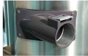
Tangential Suction Inlet, 70mm, Aluminum