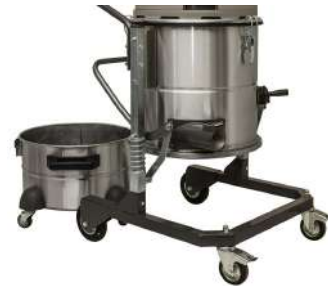
Detachable Recovery Tank for easy emptying