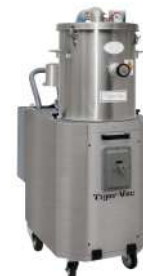
CD-120V EX (CFB) PHARMA