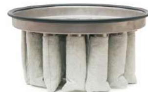
Filter Tubes Assembly for MRPFT models - Included