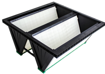
TV-595 (WF) Disposable Main Compact Filter - Included