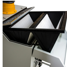
TV-595 (WF) easy access to filters