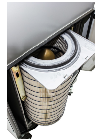
TV-600 (WF) Hemipleat Cartridge (top view) - Included